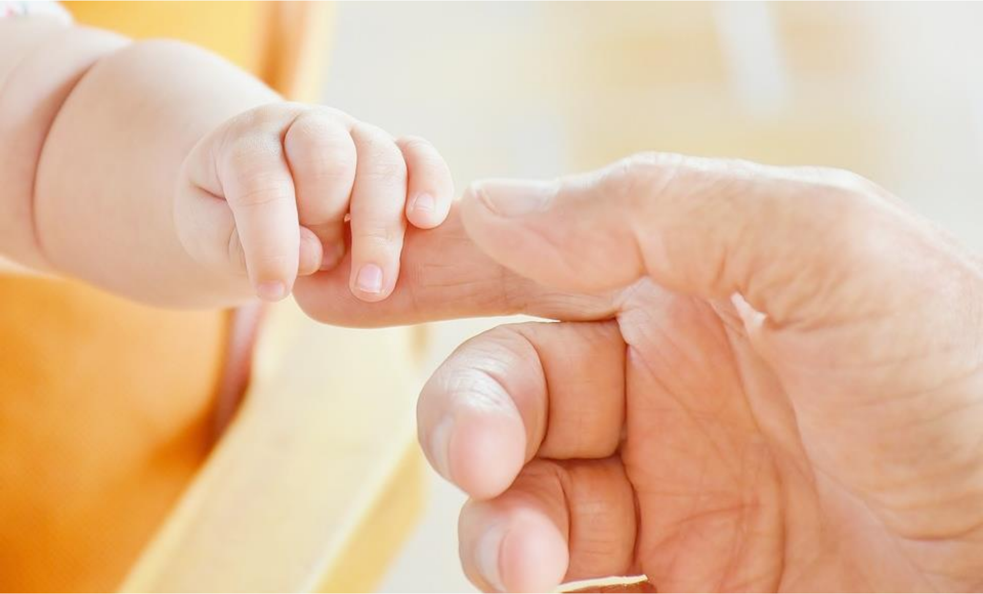
Text from the Bible